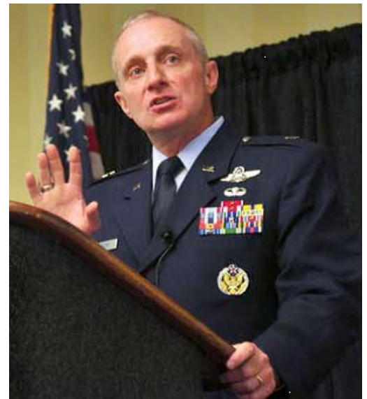
Brigadier General Garrett Harencak

General Harencak also emphasized that whether the United States is at war or not, the military's weapons are used every